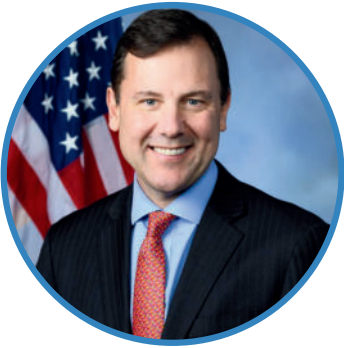
Tom Kean, Jr.

U.S. Representative for New Jersey's 7th Congressional District